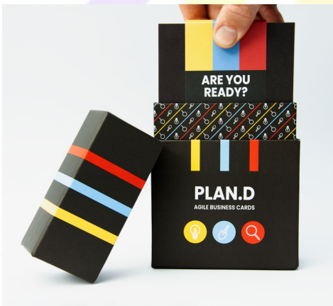
Plan.D: Agile cards